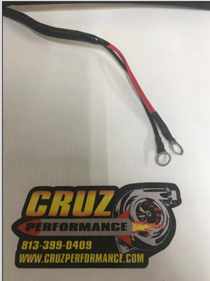
Direct Holley ECU Battery Connection