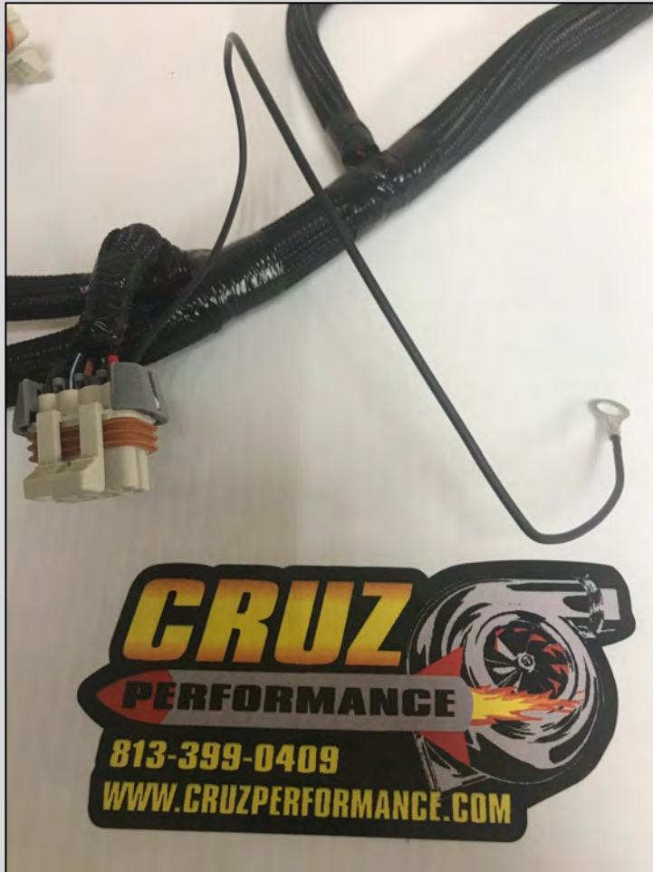
Even Side Coil Connector with Head Ground