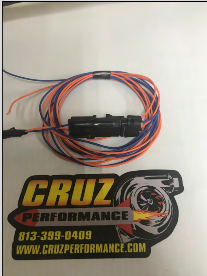
Holley Methanol Injection Plug