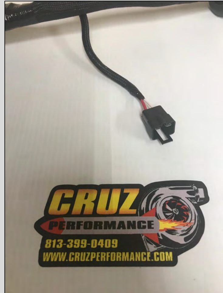
Blower Motor Plug