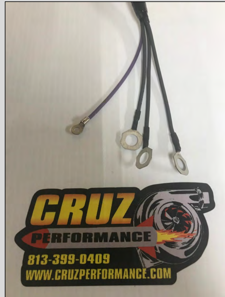
Starter Connections with Fusible Links