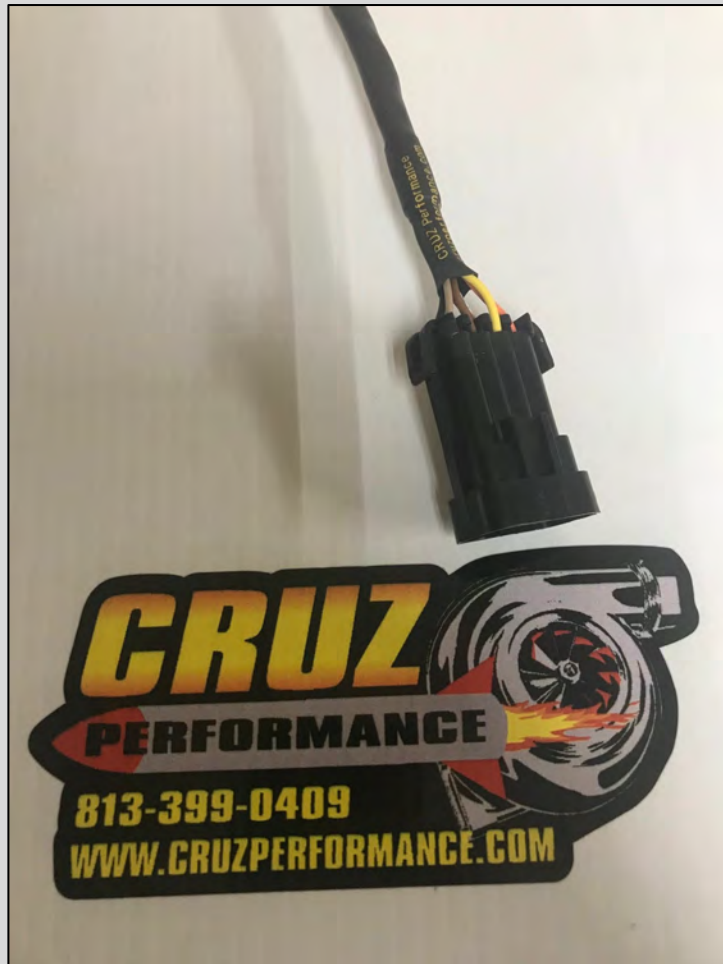
Shielded Cable Wide Band Plug