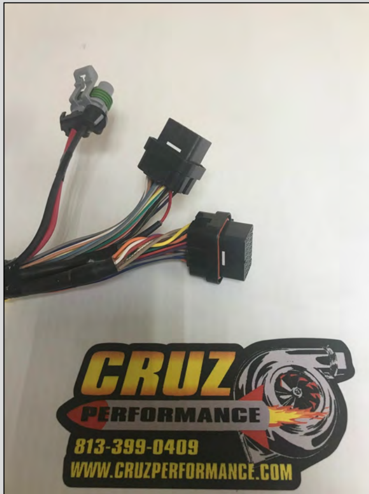
Holley EFI HP or Dominator Main Plugs with 10 Gauge Direct Battery Power Feed