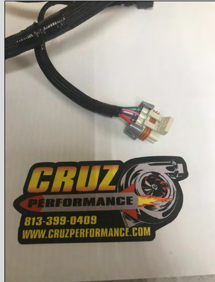
Stock Style Injector Plug with 14-Gauge Direct Battery Feed