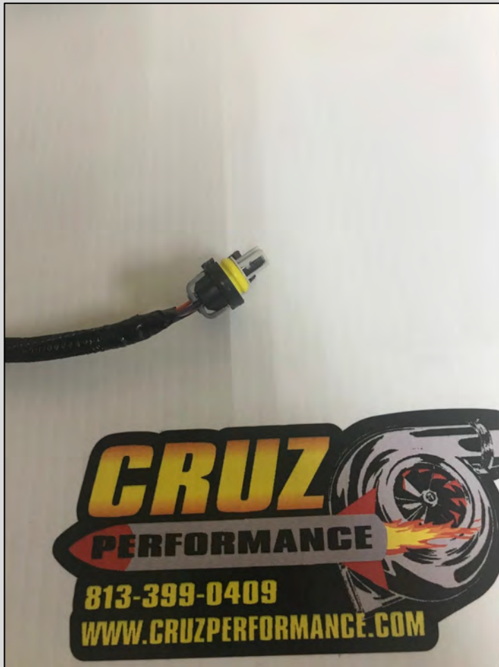
Driver Side – Fuel Pressure Sensor Plug