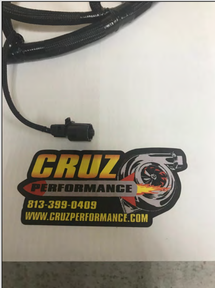
Knock Sensor Plug