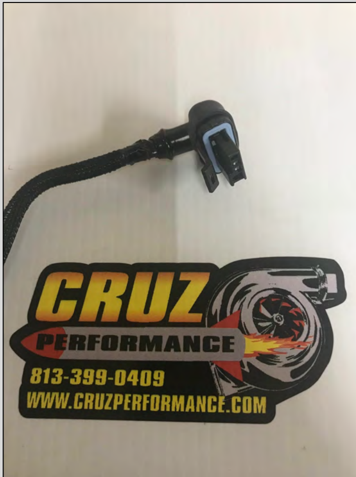
Driver Side – Alternator Plug