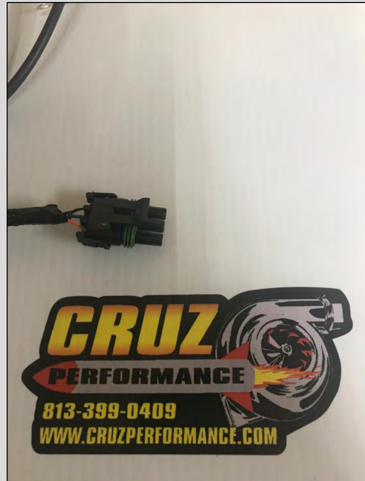
Passenger Side – TPS Plug