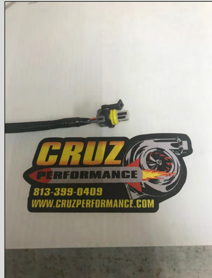
Oil Pressure Sensor Plug