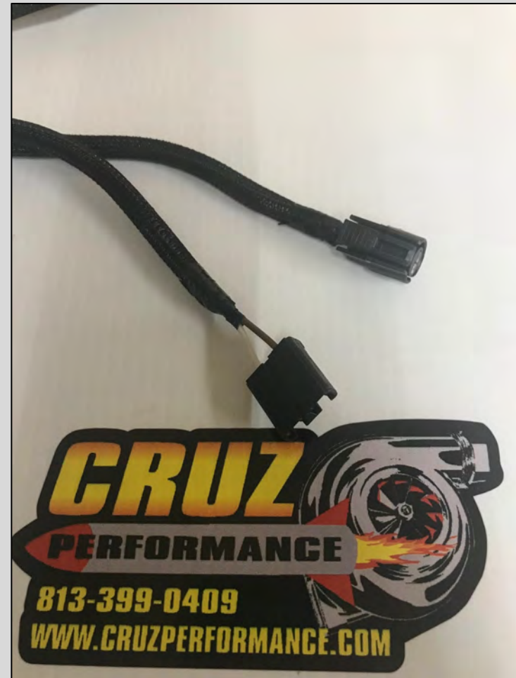
Driver Side – A/C Plugs