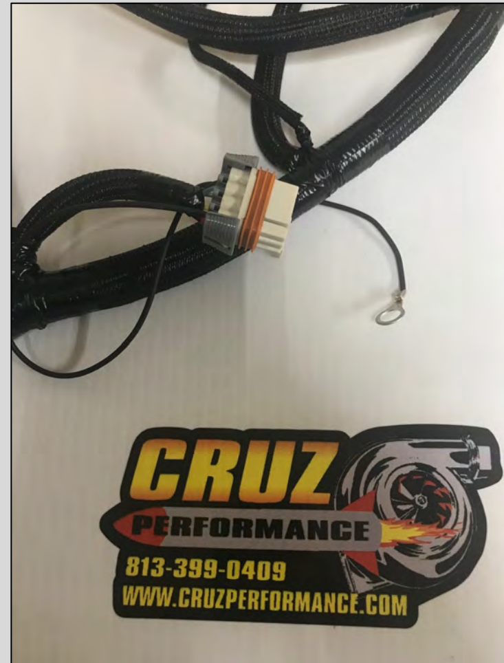
Odd Side Smart Coil Plug with Head Ground