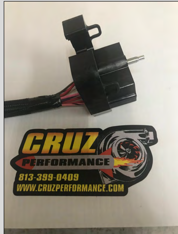
C100 Firewall Bulkhead Fuse Box Connector