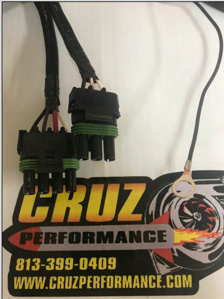
Power Master Plugs and Firewall Ground