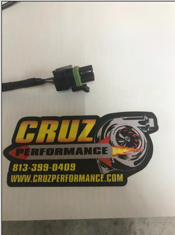
Passenger Side – IAC Plug