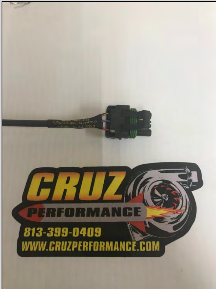
Passenger Side – Shielded Cable CAM Sensor Plug