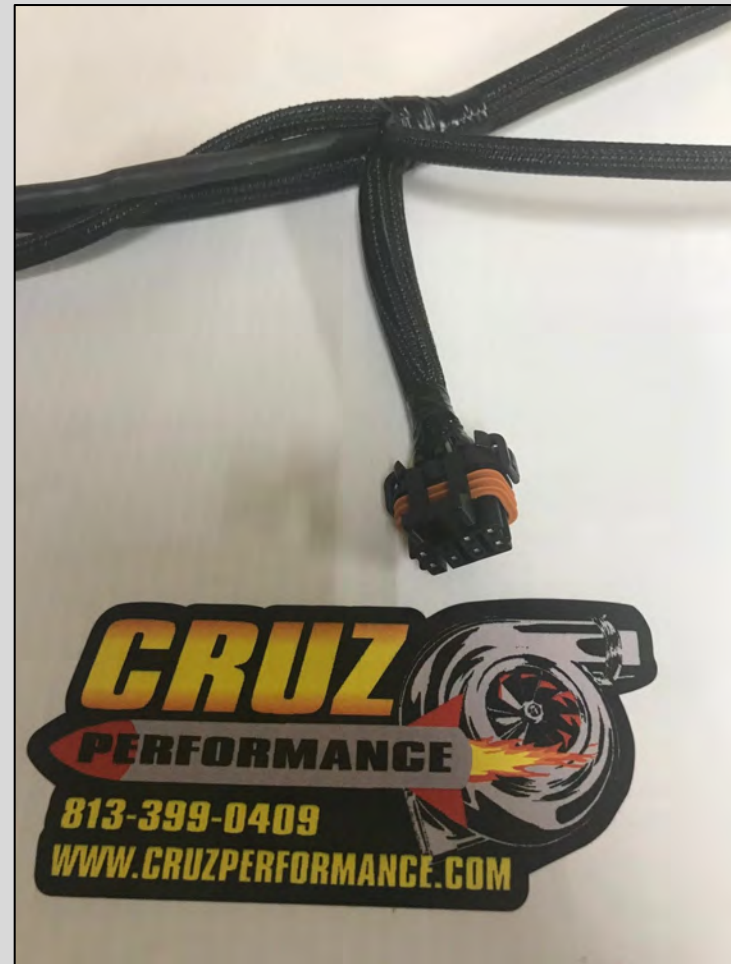
I/O Harness Plug