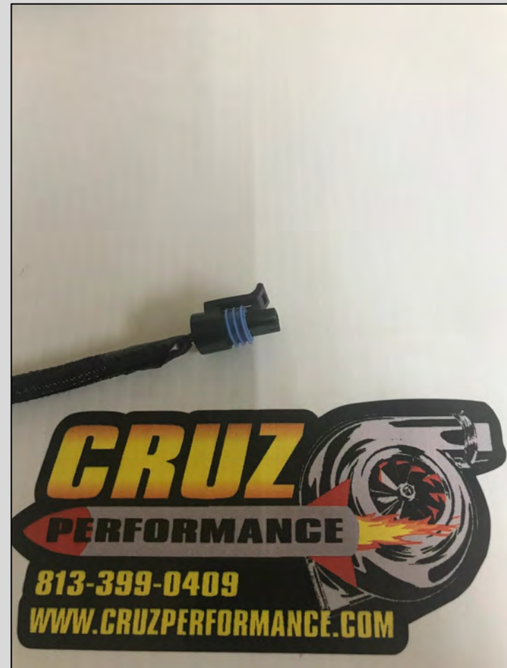
Driver Side – Coolant Temp Sensor Plug