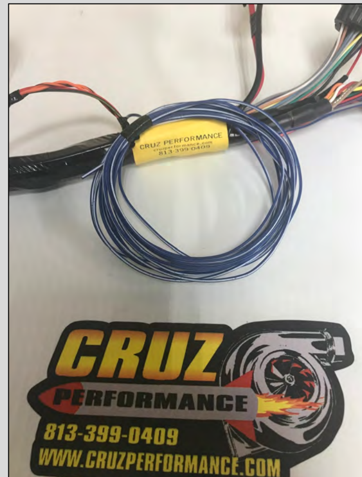
Blue with White Stripe Tach Feed for Gauge