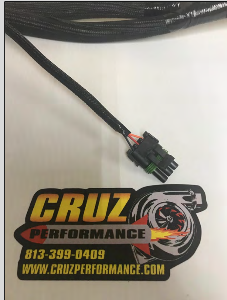
Stock Style MAP Sensor Plug