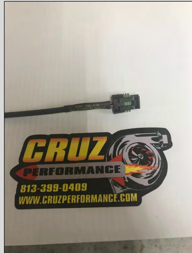
Crank Sensor Plug