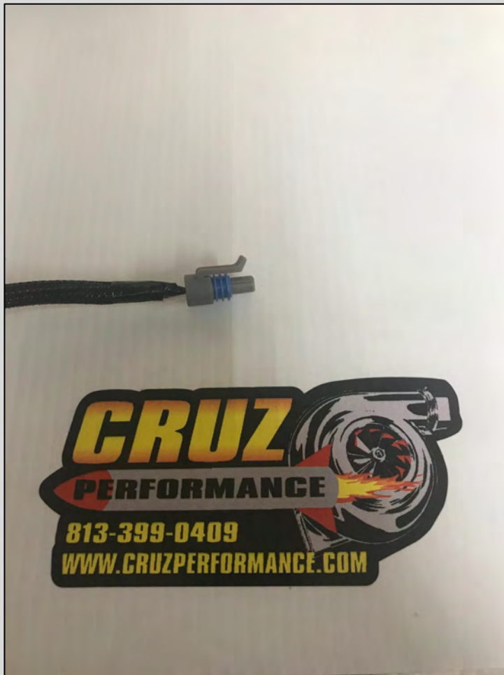
Driver Side – Inlet Temp Sensor Plug